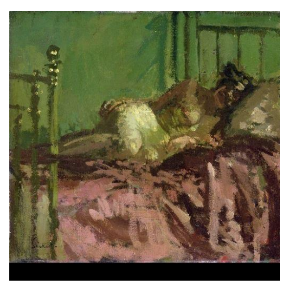
*Walter Sickert, Le Lit de Cuivre (The Brass Bed , c. 1906,] versions in private collections and in the Royal Albert Memorial Museum, Exeter, Great Britain)