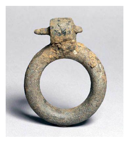
Elsa von Freytag-Loringhoven, Enduring Ornament (1913, private collection)