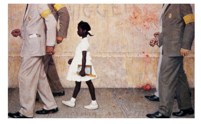
Norman Rockwell, The Problem We All Live With (1963, Norman Rockwell Museum, Stockbridge, MA)