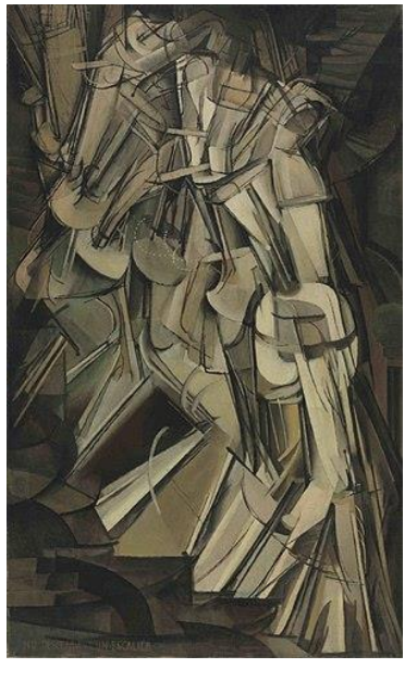
*Marcel Duchamp, Nude Descending a Staircase, No. 2 (1912, Philadelphia Museum of Art, Philadelphia, PA)

Marcel Duchamp (and Elsa von Freytag-Loringhoven?), Fountain (1917, original lost; numerous replicas are in existence around the world, including a 1964 version at Tate Britain, London, Great Britain)