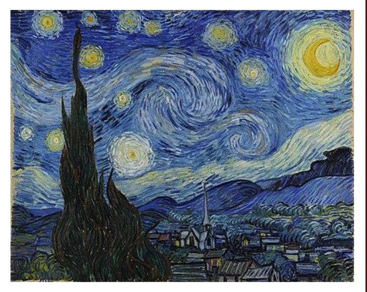
*Vincent Van Gogh, The Starry Night (1889, Museum of Modern Art, New York, NY)