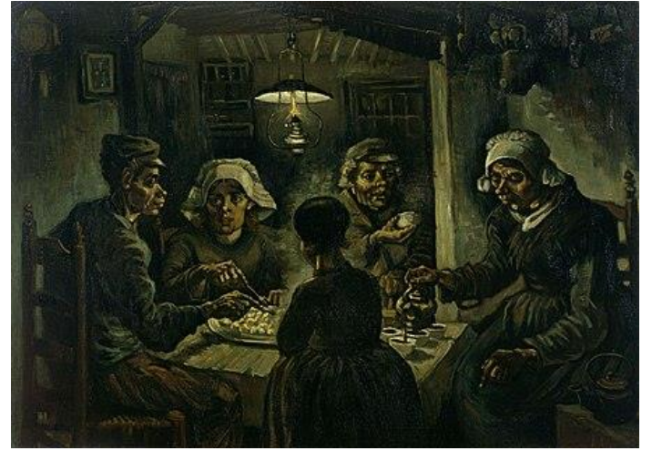
*Vincent Van Gogh, The Potato Eaters (1885, Van Gogh Museum, Amsterdam, The Netherlands)