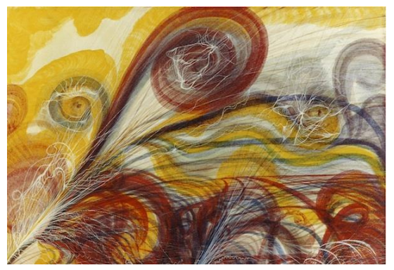
*Georgiana Houghton, The Eye of God (1861, Victorian Spiritualists Union, Melbourne, Australia)