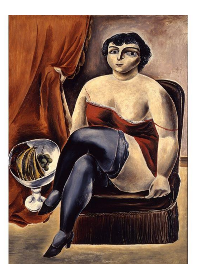
Yasuo Kuniyoshi, Circus Girl Resting (1925, Jule Collins Smith Museum of Fine Art, Auburn University, Auburn, AL)