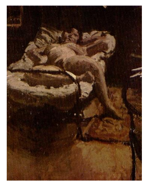
*Walter Sickert, Nuit d'été (1906, private collection)