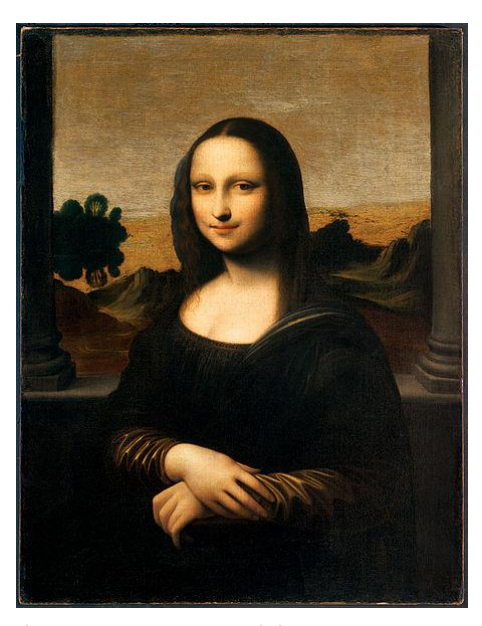
*Leonardo da Vinci (?), Isleworth Mona Lisa (c. 1503, private collection)