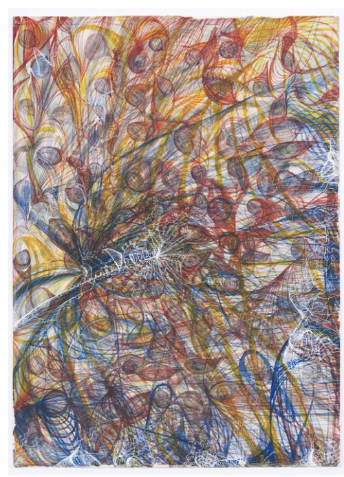
*Georgiana Houghton, The Eye of the Lord (c. 1864, Victorian Spiritualists Union, Melbourne, Australia)