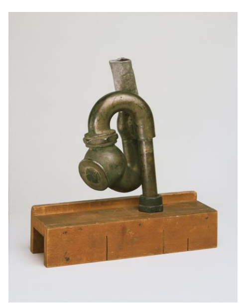
Elsa von Freytag-Loringhoven and Morton Livingston Schamberg, God (1917, Philadelphia Museum of Art, Philadelphia, PA)