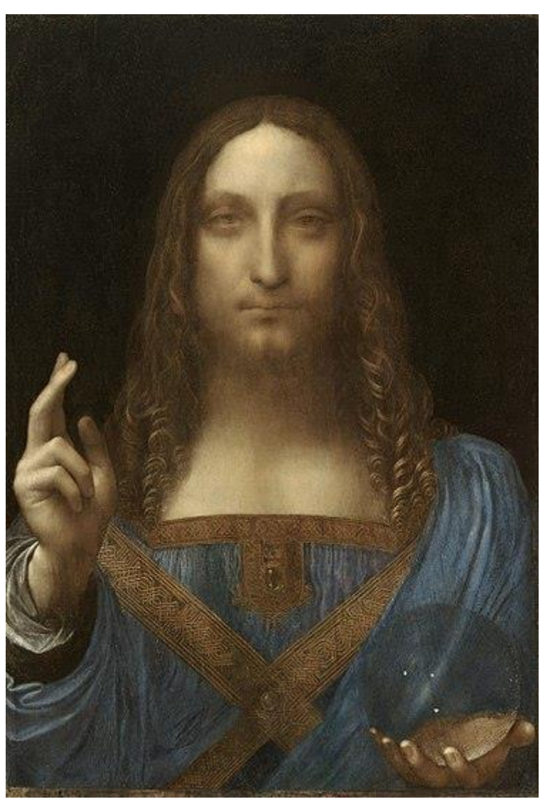
*Leonardo da Vinci (?), Salvator Mundi (c. 1500, private collection, probably crown prince Mohammed bin Salman of Saudi Arabia)