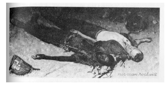
Norman Rockwell, Blood Brothers (1968, current location unknown)