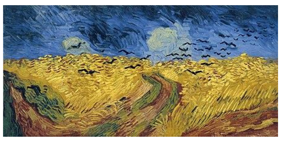
*Vincent Van Gogh, Wheatfield with Crows (1890, Van Gogh Museum, Amsterdam, The Netherlands)