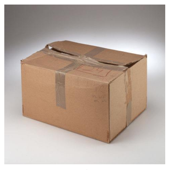
Andy Warhol, time capsules (various dates, Andy Warhol Museum, Pittsburgh, PA)