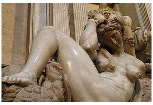
Michelangelo Buonarroti, Night (c. 1526-31, Medici Chapel, Florence, Italy)