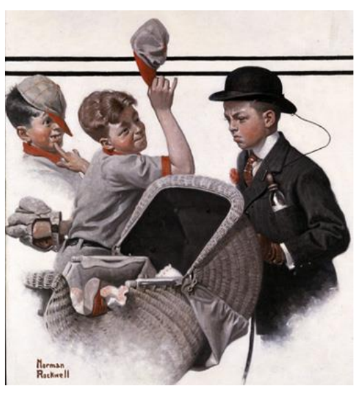
Norman Rockwell, Mother's Day Off (or Boy with Baby Carriage ) (1916, Norman Rockwell Museum, Stockbridge, MA)