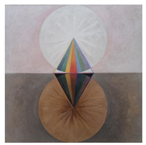
*Hilma af Klint, The Swan, No. 12 (1915, Hilma af Klint Foundation, Stockholm, Sweden)