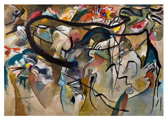
*Wassily Kandinsky, Komposition V ( Composition V , 1911, private collection)