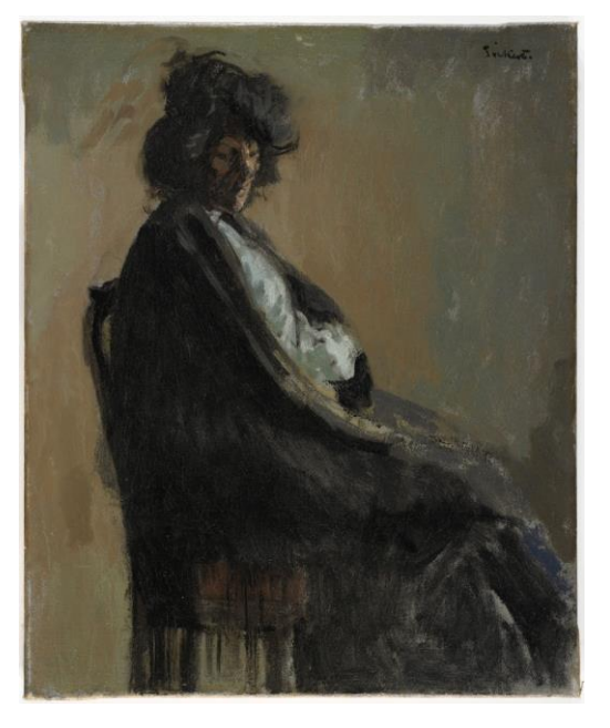
*Walter Sickert, Putana a Casa (1903-4, Harvard Art Museums, Cambridge, MA)