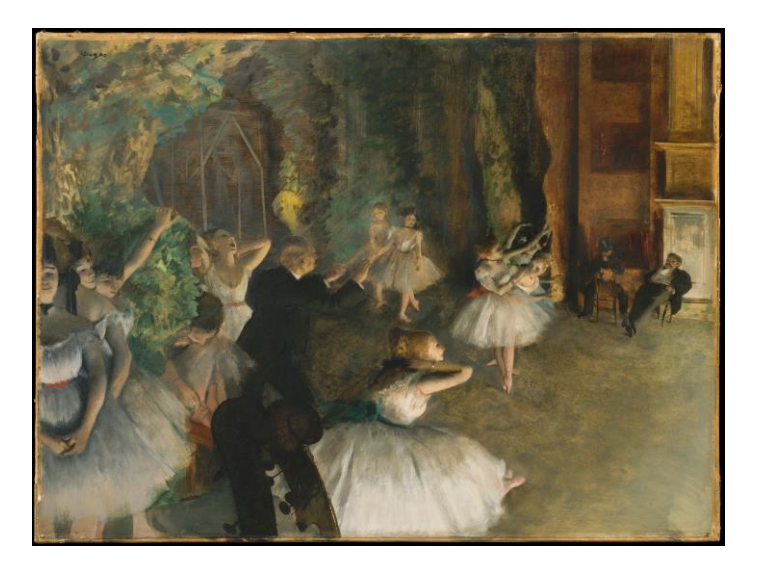
*Edgar Degas, Rehearsal for the Ballet Onstage (c. 1874, Metropolitan Museum of Art, New York, NY)