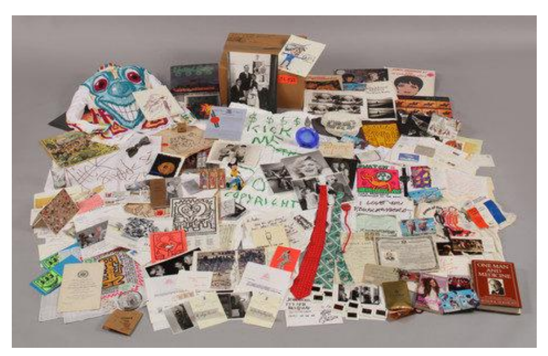
Andy Warhol, time capsules (various dates, Andy Warhol Museum, Pittsburgh, PA)