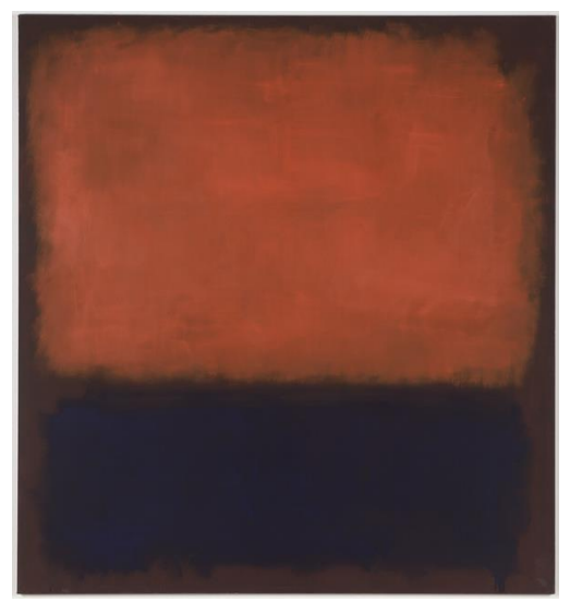
Mark Rothko, No. 14, 1960 (San Francisco Museum of Modern Art, San Francisco, CA)