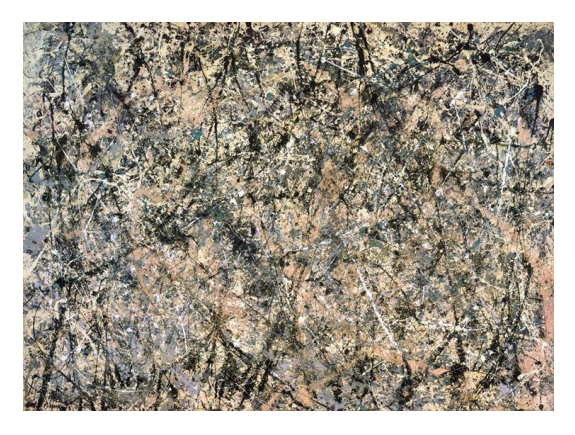
Jackson Pollock, Number 1, 1950 (Lavender Mist) (1950, National Gallery of Art, Washington, D.C.)